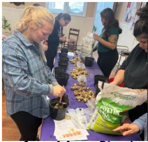
Some of our Moms Planting Bulbs